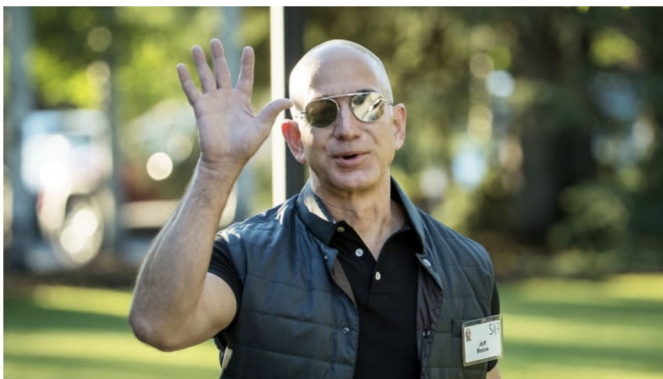
Jeff Bezos

DON'T WORRY. THE BILLIONAIRES & TECH COMPANIES LOVE LOCKDOWNS.